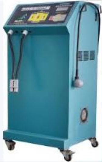
Lead acid battery regeneration